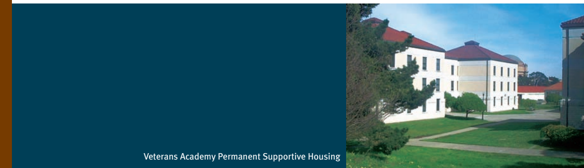
Veterans Academy Permanent Supportive Housing

“The staff at Swords was there when everyone else turned their backs.”