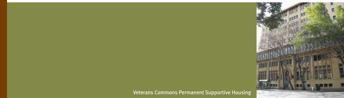
Veterans Commons Permanent Supportive Housing

Supportive Options for Homeless Veterans